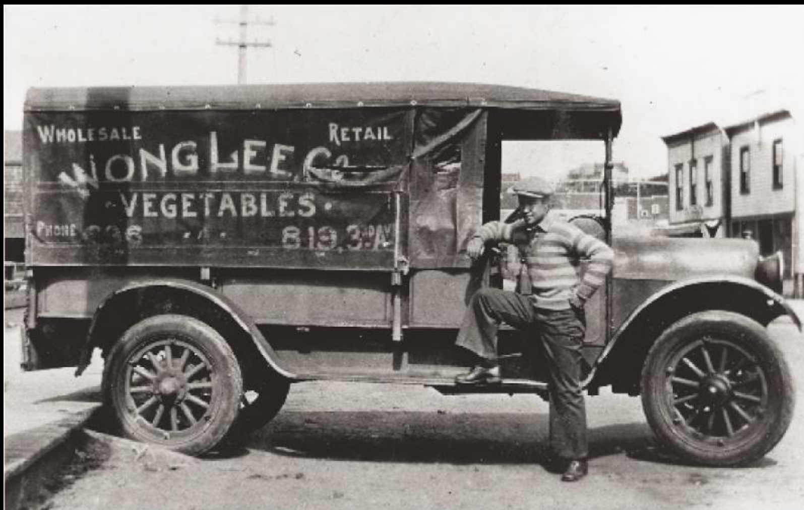
Wong Lee Co. Vegetable Truck c. 1920